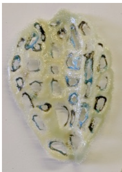
7. Diffusion , 2019 glass 14 x 10 x 2 in. (coh037)