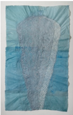
12. re: Precarious , 2019 paper pulp and handmade paper 63 x 39 in. (coh031)