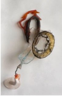
4. Issue , 2018 glass, metal, ceramic 18 x 12 x 6 in. (coh039)