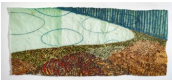
1. Underside , 2019 paper pulp, ink and handmade paper 25 x 50 in. (coh032)

Force: Observations from the Interior March 28 – May 4, 2019