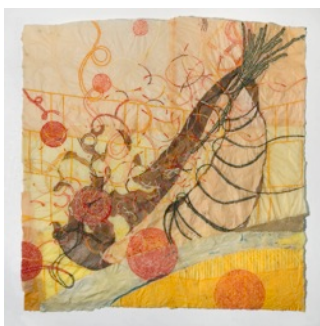
9. Public Market , 2018 paper pulp and handmade paper 52 x 52 in. (coh029)