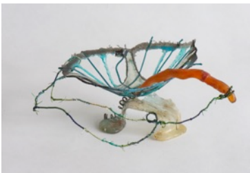
11. Momentary , 2018 glass, metal, wire 10 x 9 x 4in. (coh040)