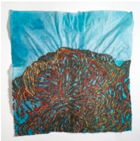
2. Low Tide , 2018 monoprint, ink, paper pulp and handmade paper 44 x 44 in. (coh027)