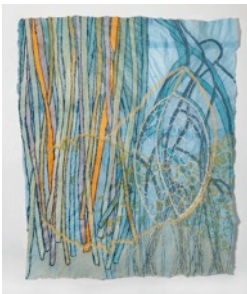
6. Scrim , 2019 paper pulp, ink and handmade paper 52 x 45 in. (coh028)