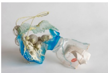
8. Fissure , 2019 glass, wire, ceramic, aqua resin 7 x 12 x 10 in. (coh036)