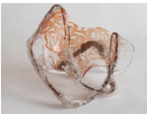
3. Intercoastal , 2019 glass, metal 6 x 13 x 12 in. (coh038)