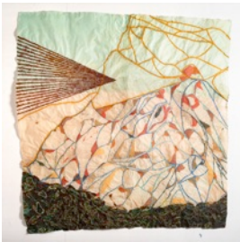
5. Breakwater , 2018 paper pulp, ink and handmade paper 54 x 54 in. (coh023)