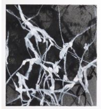
Tamar Zinn Untitled 20-38, 2020 Graphite and oil pastel on paper paper dimensions: 13 ½ x 12 in. framed dimensions: 15 x 13 5/8 in. (zinn1029)