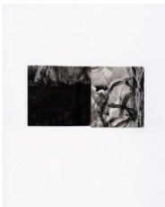
Jeffrey Cortland Jones Into the Trees (Yard) , 2019 ink on synthetic paper, mounted on Stonehenge 10 x 8 in. 15 x 13 in. framed size (cort103)