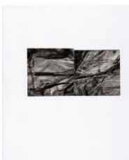
Jeffrey Cortland Jones Into the Trees (Thicket) , 2019 ink on synthetic paper, mounted on Stonehenge 10 x 8 in. 15 x 13 in. framed size (cort104)