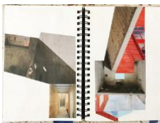
Julian Jackson Notebook Collage , 2018 pasted papers on paper 9 1/2 x 14 in. (jack295)