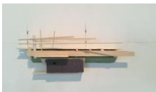
Liz Sweibel Untitled, 2016 wood, paint 3 3/4 x 8 x 1 1/4 in. (swei010)