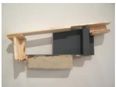
Liz Sweibel Untitled, 2016 wood, paint 4 x 9½ x 2 in. (swei013)