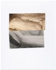
Jeffrey Cortland Jones Starstrewn (Flatfield) , 2019 oil on synthetic paper, mounted on Stonehenge 10 x 8 in. 15 x 13 in. framed size (cort107)