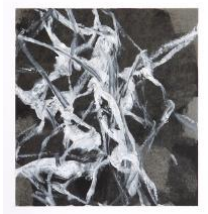
Tamar Zinn Untitled 20-31, 2020 Graphite and oil pastel on paper paper dimensions: 8 2/3 x 7 in. framed dimensions: 9 1/2 x 9 in. (zinn1032)