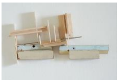
Liz Sweibel Tilt, 2016 wood, paint 6½ x 11 x 2½ in. (swei008)