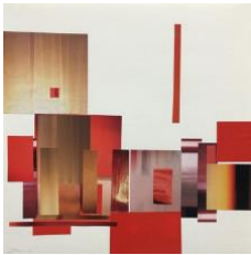
Julian Jackson Collage; Reds, 2009 pasted papers on paper 12 x 12 in. (jack293)