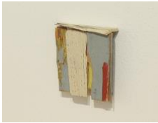
Liz Sweibel Untitled, 2012 wood, paint 2 1/2 x 2 3/8 x 3/4 in. (swei011)