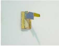
Liz Sweibel Hinge , 2012 wood, paint 2 1/8 x 2 x 2 3/4 in. (swei012)