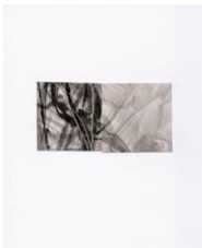
Jeffrey Cortland Jones Into the Trees (Copse) , 2019 ink on synthetic paper, mounted on Stonehenge 10 x 8 in. 15 x 13 in. framed size (cort106)