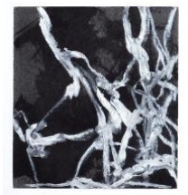
Tamar Zinn Untitled 20-34, 2020 Graphite and oil pastel on paper paper dimensions: 8 2/3 x 7 in. framed dimensions: 9 1/2 x 9 in. (zinn1033)