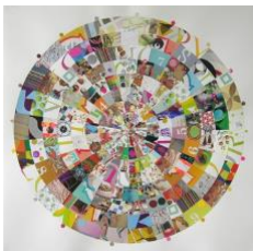
Josette Urso Four Eight Six, 2020 paper collage paper size: 36 x 36 in. frame size: 38 x 38 in. (urso216)