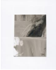
Jeffrey Cortland Jones Starstrewn (Pulled) , 2019 oil on synthetic paper, mounted on Stonehenge 10 x 8 in. 15 x 13 in. framed size (cort108)