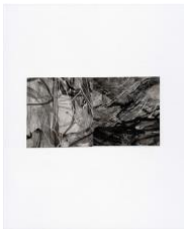
Jeffrey Cortland Jones Into the Trees (Inhabit) , 2019 ink on synthetic paper, mounted on Stonehenge 10 x 8 in. 15 x 13 in. framed size (cort105)