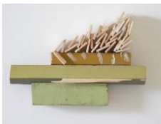
Liz Sweibel Untitled, 2016 wood, paint 6 1/4 x 6 5/8 x 1 1/4 in. (swei009)