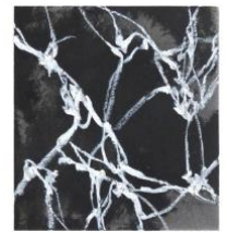
Tamar Zinn Untitled 20-40, 2020 Graphite and oil pastel on paper paper dimensions: 13 ½ x 12 in. framed dimensions: 15 x 13 5/8 in. (zinn1030)