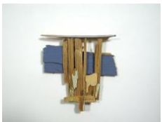
Liz Sweibel Untitled wood, paint 2¼ x 2¼ x ¼ in. (swei014)