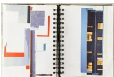
Julian Jackson Notebook Collage, 2017 pasted papers on paper 8 x 12 1/2 in. (jack294)