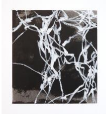
Tamar Zinn Untitled 20-37, 2020 Graphite and oil pastel on paper paper dimensions: 13 ½ x 12 in. framed dimensions: 15 x 13 5/8 in. (zinn1028)