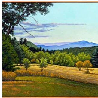
“Landscapes and Figures”: A Solo Exhibit by Ralph Moseley At Lockwood Gallery (Sponsored) Jun 7, 2019