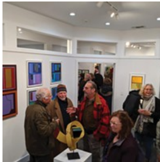
Art Gallery Spotlight: The Lockwood Gallery Jul 1, 2021