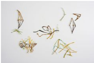
Nancy Cohen Lake Lines , 2020 glass 28 x 38 in. (coh061)