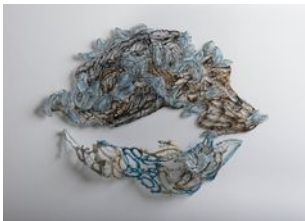
Nancy Cohen Vestige , 2021-22 glass, metal, and handmade paper 19 x 25 x 2 in. (coh064)