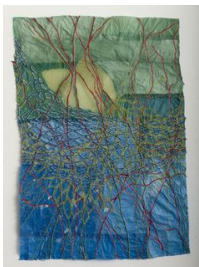
Nancy Cohen Capillarium , 2021 paper pulp and handmade paper 52 x 36 in. (coh054)