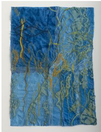
Nancy Cohen Diffusion , 2021 paper pulp and handmade paper 47 x 33 in. (coh055)