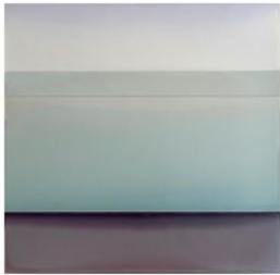
Susan English Verge No. 2, 2022 tinted polymer on Dibond panel 34 x 35 in. (eng181) $ 5,800.00