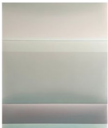
Susan English Lieutenant's Island, 2022 tinted polymer on Dibond panel 65 x 54 in. (eng177) $ 11,000.00