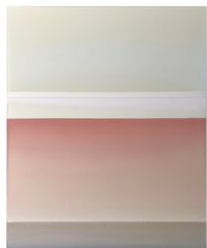
Susan English Into White Sky, 2022 tinted polymer on Dibond panel 59 x 48 in. (eng175) $ 9,200.00