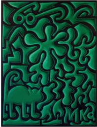
Meg Atkinson Green Forest , 2023 oil on canvas 40 x 30 in. (aaf005)