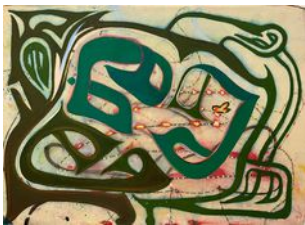
Sharon Horvath Path Language 1 , 2023 pigment, polymer, ink, on paper mounted on canvas 22 x 30 in. (aaf001)