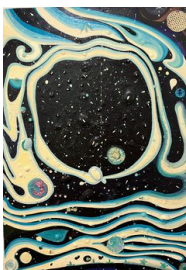
Sharon Horvath Meditator Mirror , 2023 pigment, polymer, and ink on paper mounted on canvas 30 x 22 in. (aaf006)