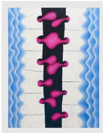
Meg Atkinson All Talk and No Do , 2023 oil on canvas 40 x 30 in. (aaf023)